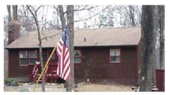
Bathhouse Caretaker's Cabin