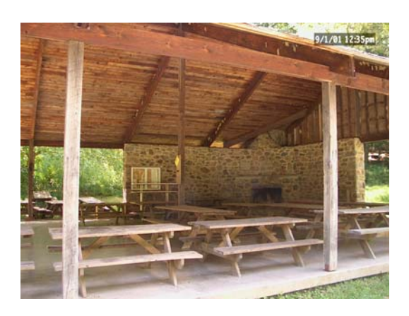
2000 Square Foot Pavilion with Fireplace

The Northern Virginia Lions Youth Camp, Inc., is a non-profit public service organization supported by the Lions Clubs of District 24A.