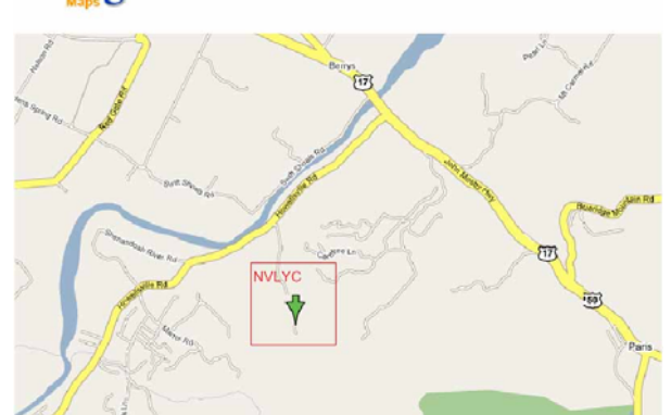
Park West Cabin