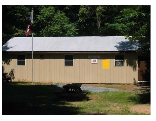
Herndon/Fauquier Host Cabin

Over the years youth groups, such as Boy Scouts, Cub Scouts, Girl Scouts, and church groups, have used the camp. Lions clubs have had picnics and overnight stays and shared lots of good fellowship. Boy Scout Eagle projects such as the Amphitheater, Orienteering Trail, Horseshoe pits, Maintenance building, bunk beds, and picnic tables have improved the camp.